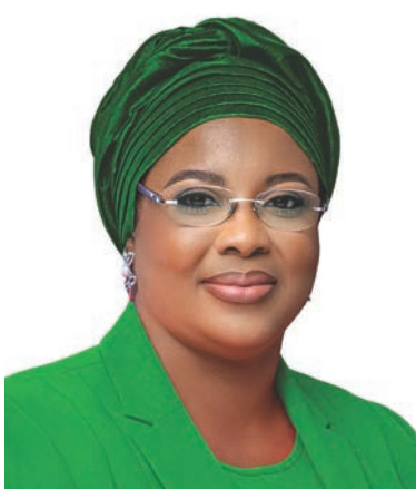
Hon. Khafilat Ogbara, Koshofe Federal Constituency Lagos State