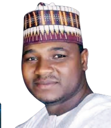
Hon. Murtala Usman Banye, Batagarawa/Charanchi/Rimi Constituency