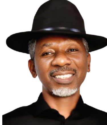
Hon. Barr. Jesse Okey-Joe Onuakalusi, Oshodi/Isolo II Federal Constituency, Lagos.