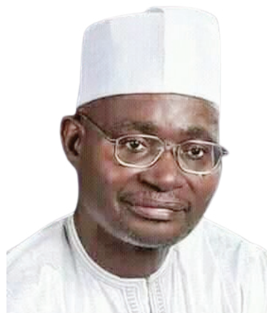
Senator Binos Dauda Yaroe, Adamawa Southern Senatorial Zone