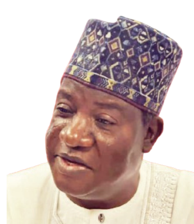
Senator Simon Bako Lalong, Plateau South Senatorial District