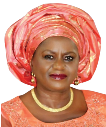
Senator Ipalibo Harry Banigo, Rivers West Senatorial District