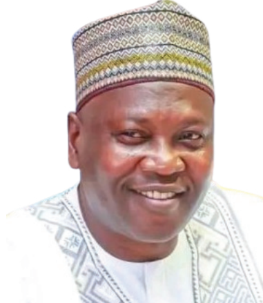
Rt. Hon. Kabiru Alhassan Rurum, Rano/Bunkure/Kibiya Federal Constituency