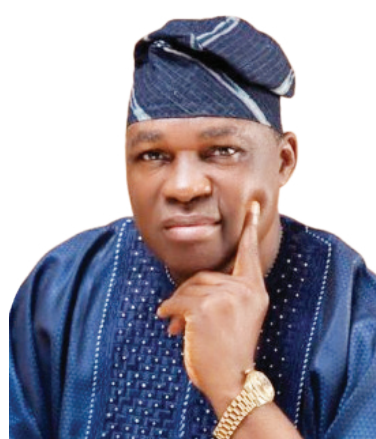
Senator Oyewumi K.O., Osun West Senatorial District