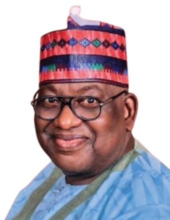
Senator Rufai Hanga, Kano Central Senatorial District